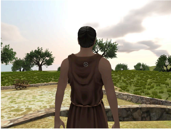
Figure 10: Screen shot from the Vari House virtual world showing position six of the avatar.