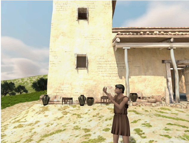
Figure 9: Screen shot from the Vari House virtual world showing position five of the avatar.