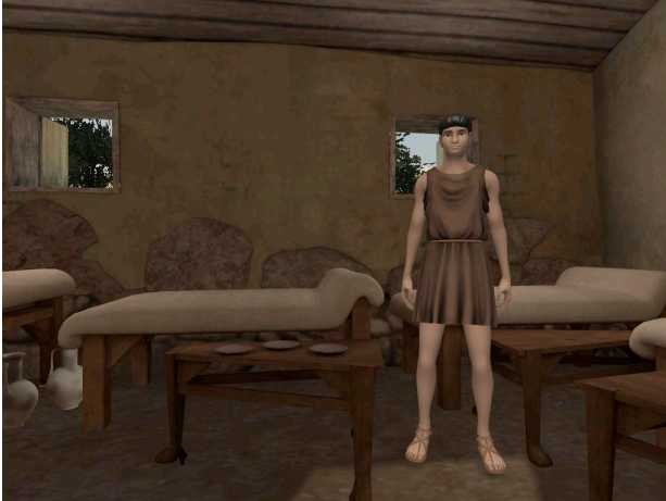
Figure 7: Screen shot from the Vari House virtual world showing position three of the avatar.