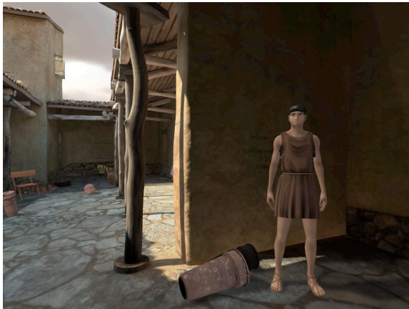
Figure 5: Screen shot from the Vari House virtual world showing the initial position of the avatar.