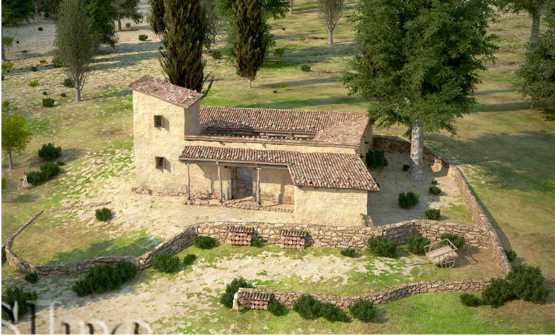
Figure 3: Vari House, aerial view (from the Learning Sites virtual reality model; © 2010 Learning Sites).

A verandah roof that shades the Vari House faces toward the south, and the layout of rooms along the north side. This layout follows closely what ancient Greek and Roman writers tell us about the ideal setting for a dwelling: it should be open and face toward the sun, it should be closed off from cold north winds, and it should capture the heat and light of the sun appropriately for the seasons. Further, the distribution of materials follows the teachings of the ancient writers: place perishable building materials (in the Vari House, the mud brick of the walls and wood ceiling framing and columns) between imperishable materials (in the Vari House, between a stone foundation and ceramic tile roof) to protect the perishable materials from the weather [23-24]. The walls between the rooms at the back of the house are thin since they only support their own weight. The corner room's walls are so thick that archaeologists believe they supported a two-story tower.