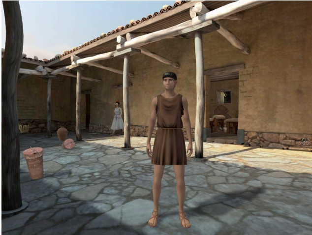
Figure 6: Screen shot from the Vari House virtual world showing position two of the avatar.