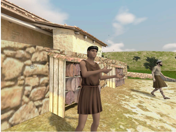
Figure 11: Screen shot from the Vari House virtual world showing another view of position six of the avatar.