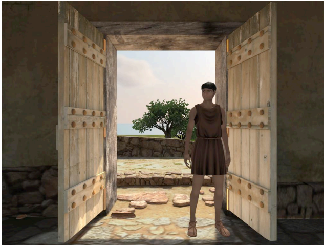
Figure 8: Screen shot from the Vari House virtual world showing position four of the avatar.