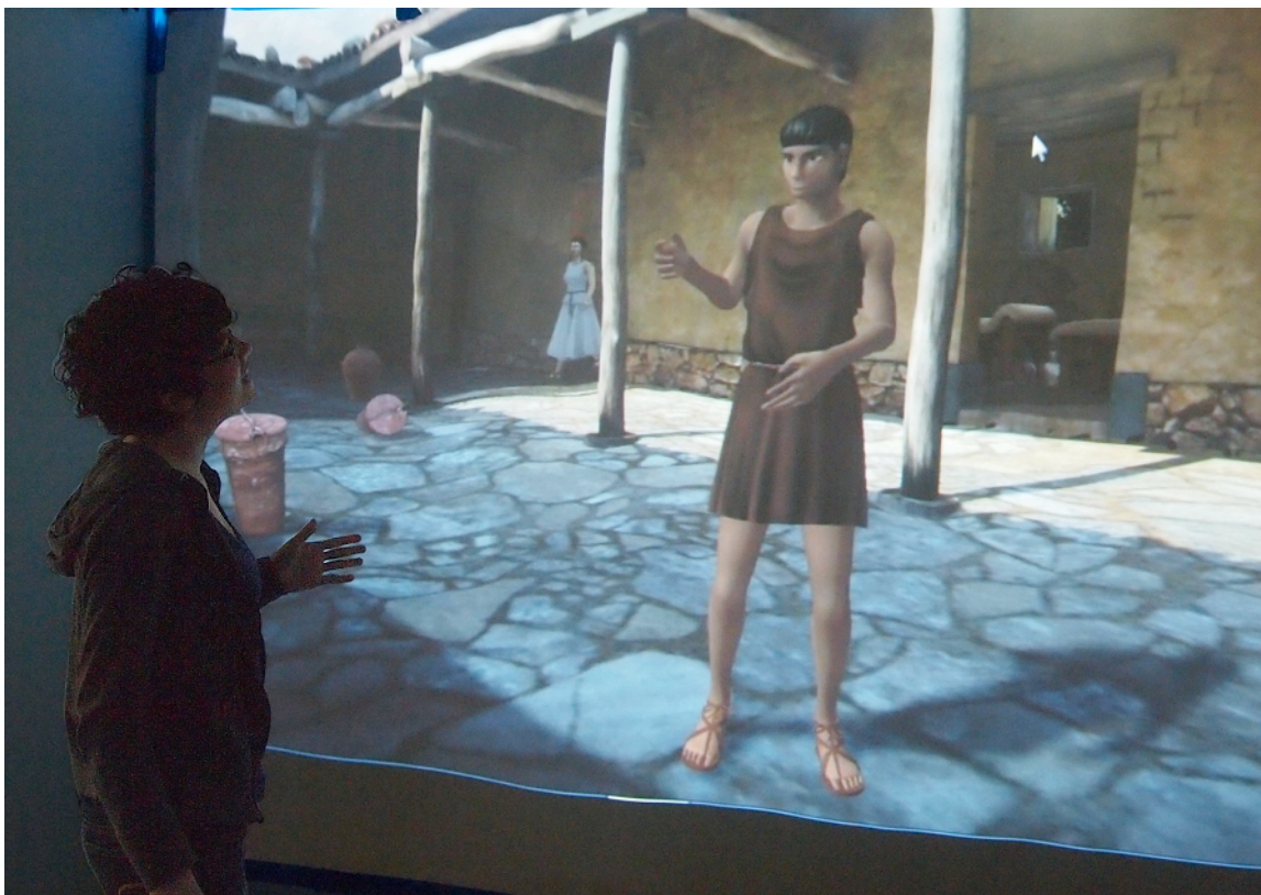
Figure 1: An audience member converses with the digital puppet, Orestes, "in" the courtyard of the Vari House. His mother is visible in the background.

The star of the show is an avatar representing a young teenage farmer (Orestes), controlled by a live puppeteer. The operator sees the audience through a Webcam and can move the avatar freely through the virtual space. The avatar addresses the audience directly, in character, according to a flexible script developed for the particular lesson, audience, or situation. The avatar puppet can communicate through voice, gesture, and visual context. He can describe the architectural and archaeological features of his environment, pointing to individual aspects of the house to address specific curriculum needs. He can then use the context to talk about ancient daily life, history, religion, or economics. The action and dialogue can follow a prescribed storyboard or can be extemporaneous, responding to audience feedback.