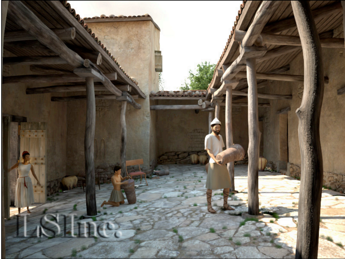
Figure 2: Orestes' family (his mother, father, and younger brother). They don't do much, yet, but just their presence provides a scale and social context to the architecture (from the Learning Sites virtual reality model).