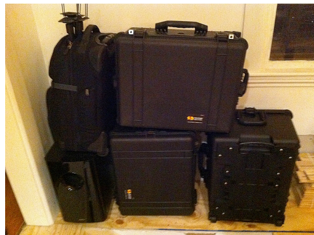
Figure 3: All the equipment needed for an Oracle show.

All of the electronic equipment for the show can be packed into the luggage shown in Figure 3. It includes a laptop computer, an Xbox 360 game controller and audio/mike headset for the puppeteer, a stereo amplifier, a mixer, two mobile microphones with their base station, 5 speakers with tripod stands, a short-throw projector, and cabling. The luggage also has room for physical props, the costume for the actress, and printed handouts. All of this is detailed in Nambiar (2011).