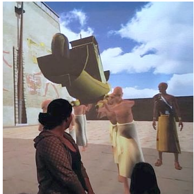
Figure 1: Live people and avatars interact.

We implemented the virtual environment and animations with the Unity game engine ( http://unity3d.com ) as an application that can run on a standard Windows® laptop. The software then introduces reverb with the aid of a 32-bit sound effects processor. It provides a wide range of effects such as echo, chorus, and double slap. The amplifier output can be increased from 80 watts through 2 channels to 130 watts through a 5-channel surround system. A powered amplifier along with a separate low-frequency line out gives us more bass control. A mixer gives a human sound-system operator more control over sound and eliminates floor noise.