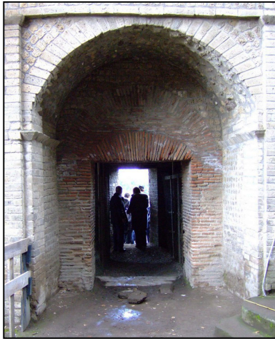
Figure 3: Entrance to the ambulatory/crypta from the Triangular Forum, with exit to the Theatre beyond.

based on new photographs and measurements taken on the site. This new model is web based and it will be the centrepiece of an innovative web site that allows the cyber visitor to compare individual elements from the model with photographs and historical images (JACOBSON 2010). Eventually, the user will be able to navigate efficiently between the virtual space, the data, the metadata, and the way these data have been interpreted. The website will be flexible enough to accommodate new information for later development of the site as it becomes available.