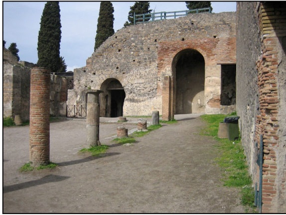
Figure 6: Colonnades between theatre (background left and rear) and small theatre (foreground right).

Since parts of both the inserted vault (Figure 5) and the new portico (Figure 6) are in red brick, this construction may be related to a rebuilding of the theatre scaena , or stage building, in the same material and excavation now suggests extensive Julio-Claudian (Neronian) rebuilding in the Triangular Forum (CARANDINI et al. 2001, CARAFA 2002) as well. There is evidence, therefore, for a much broader program of Julio-Claudian renovation across the theatre district than has been traditionally noted and one that will require a much broader effort than ours—with architect and formal survey—to describe.