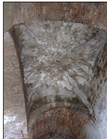
Figure 5: Corridor between theatre and Via Stabiana. Groin vault with brick arches.

The history of the theatre district before and after the Holconian project is unclear. Some connective tissue must have existed between the theatre and the “small theatre” before the Augustan period and post-Augustan construction was carried out there as well: a new arch and groin vault were inserted into the vaulted corridor leading from the Grand theatre to the street (Figure 5), probably to connect the corridor with a new set of colonnades built in front of it (Figure 6).