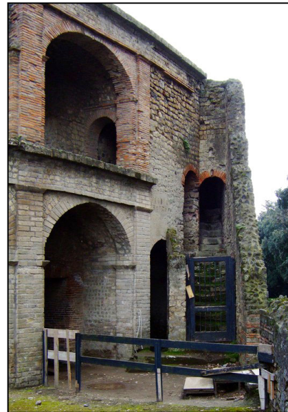
Figure 4: Theatre Passage Block. Stairs to upper seating (right), entrance to crypta (left), entrance to latrine (centre).

access routes between the theatre and the Triangular forum, in the form of a structure that we call the “Theatre Passage Block”. This structure separated the two areas visually but connected them at multiple levels. It included the eastern third of the crypta / ambulatory, with access doors to the cavea (Figure 3) and two staircases leading to the upper levels of seating (Figure 4). A small latrine was tucked into the space beneath the ambulatory and the staircases.