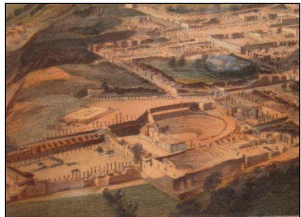
Figure 7: Topography of Theatre District within broader slope of site. Lithograph after drawing by A. Guesdon (1849).

Second, the size, integrity, and complexity of the “Theatre Passage Block” are all but invisible in plans (cf. Figure 1) and are easily overlooked in still photos where they appear to be a natural part of the theatre. One of the contributions that a 3D model can make therefore is to refocus the discussion of the Theatre district— from its current focus on the monuments that make up the space to the way the monuments connect. The model helps the cyber visitor understand how structures like the Theatre Passage Block changed the way people experienced this difficult topography in a way that existing images, plans, and descriptions of the site do not. It broadens the definition of monumentality, posing the question of how the Holconii, and perhaps other building patrons, created a sense of cohesion and, with it, monumentality on this uneven terrain.