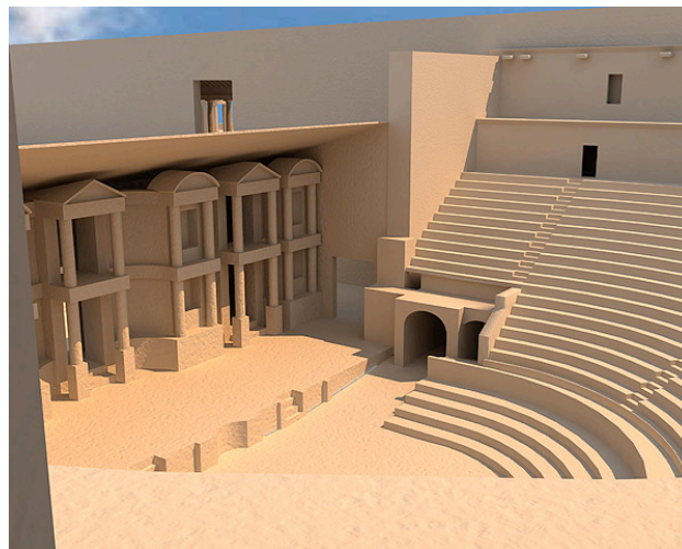
Figure 1: Virtual model of the Grand Theater

In this project, we will place musical compositions inspired by ancient Greco-Roman music and ambient sounds in our Virtual Theater District of Pompeii. (The city was preserved under volcanic ash in a cataclysmic eruption in 79AD, and unearthed nearly two thousand years later.) The viewer can traverse our three-dimensional reconstruction on a computer, moving a virtual viewpoint through the space (Weis, Jacobson, & Darnell, 2010). The